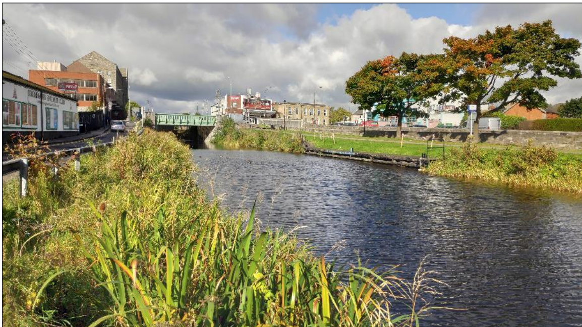
Plate 3.4 Representative image of site RC1 on the Royal Canal at Phibsborough (5 th lock)

In summary, this site on the Canal and situated within the Royal Canal pNHA (002103), exhibited high coarse fish habitat, high European eel habitat, and of high quality for otter as a foraging area.