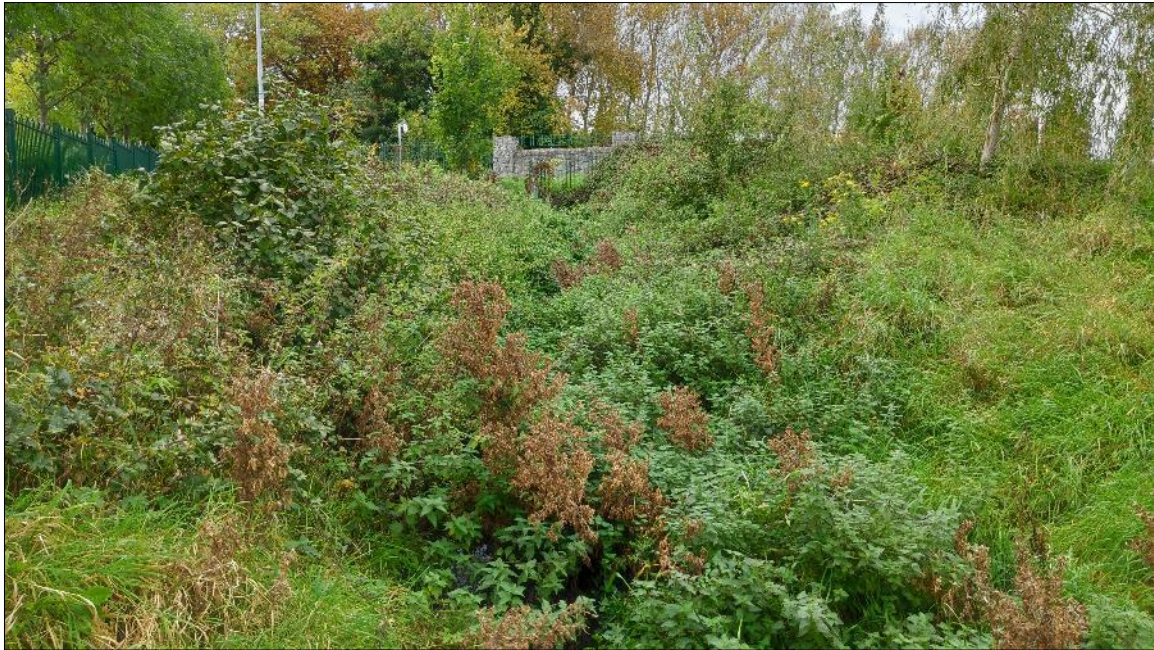
Plate 3.12 Representative image of site P1 on the upper reaches of the River Poddle (heavily scrubbed-over, facing upstream to road crossing)